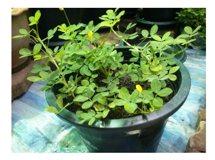
Fig. 1 Arachis pintoi Krap. & Greg (Thua lisong tao)

The objectives this study were to investigate the ability and potential of Arachis pintoi Krap. & Greg. to remove Arsenic (As) in CA dumping site and evaluate the potential of plants for remediation.