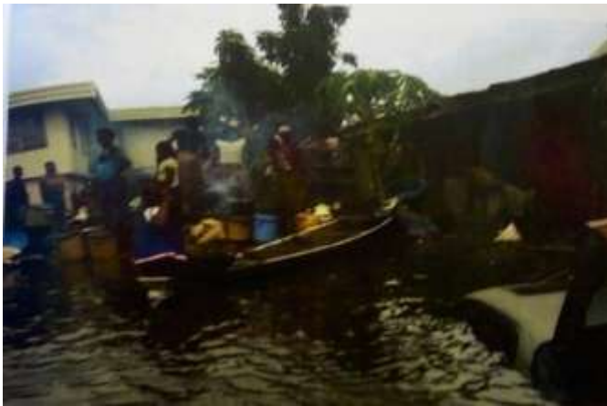
Plate 3: Showing people living under harsh human conditions due to effects of flooding.