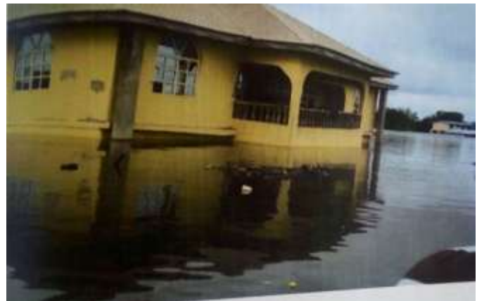
Plate 1: Showing submerged Buildings

The most devastating effects of 2012 flooding in Ogaru Local Government are the damage to infrastructure, crops and water quality. Roads and footpaths were submerged making movement impossible. Even 6 months after the floods receded, debris and silt deposits were seen covering the roads. Electricity transformers were submerged and destroyed; electric poles were pulled down, affecting power supply in the area up to one year after the incident. Buildings were submerged which resulted in occupants being trapped, or displaced. While some occupants relocated to stay with relatives or in displaced people’s camps, others stayed back to live under harsh human conditions (Plate 1, 2 and 3). Factories and other minor industries were not spared thereby putting a halt to economic activities.