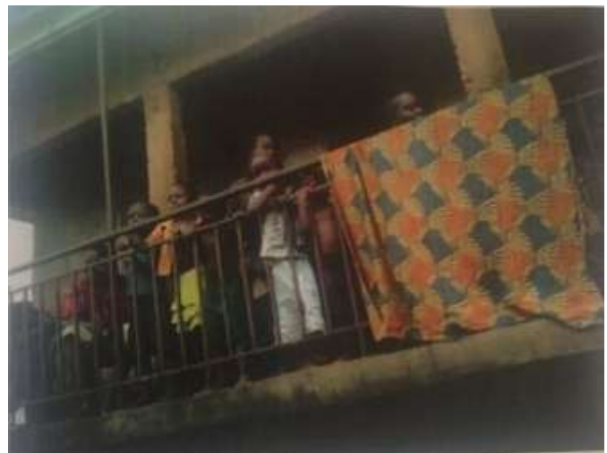
Plate 2: Showing occupants being trapped after a heavy flooding