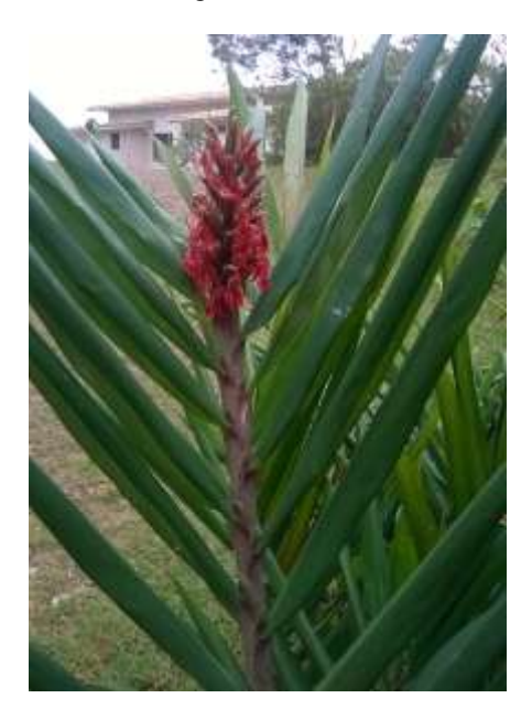
Fig 1: The plant of A.nigra

literature survey revealed that the antifungal activities of A. nigra for such an infectious diseases have not been studied extensively and only a handful investigations have been found regarding the phytochemical and biological properties of the plant [1],[2],[4],[5]. The present study was carried out in order to investigate the bioactivity in the essential oil of the rhizome of A. nigra using antifungal activity against human skin infections causative fungi.